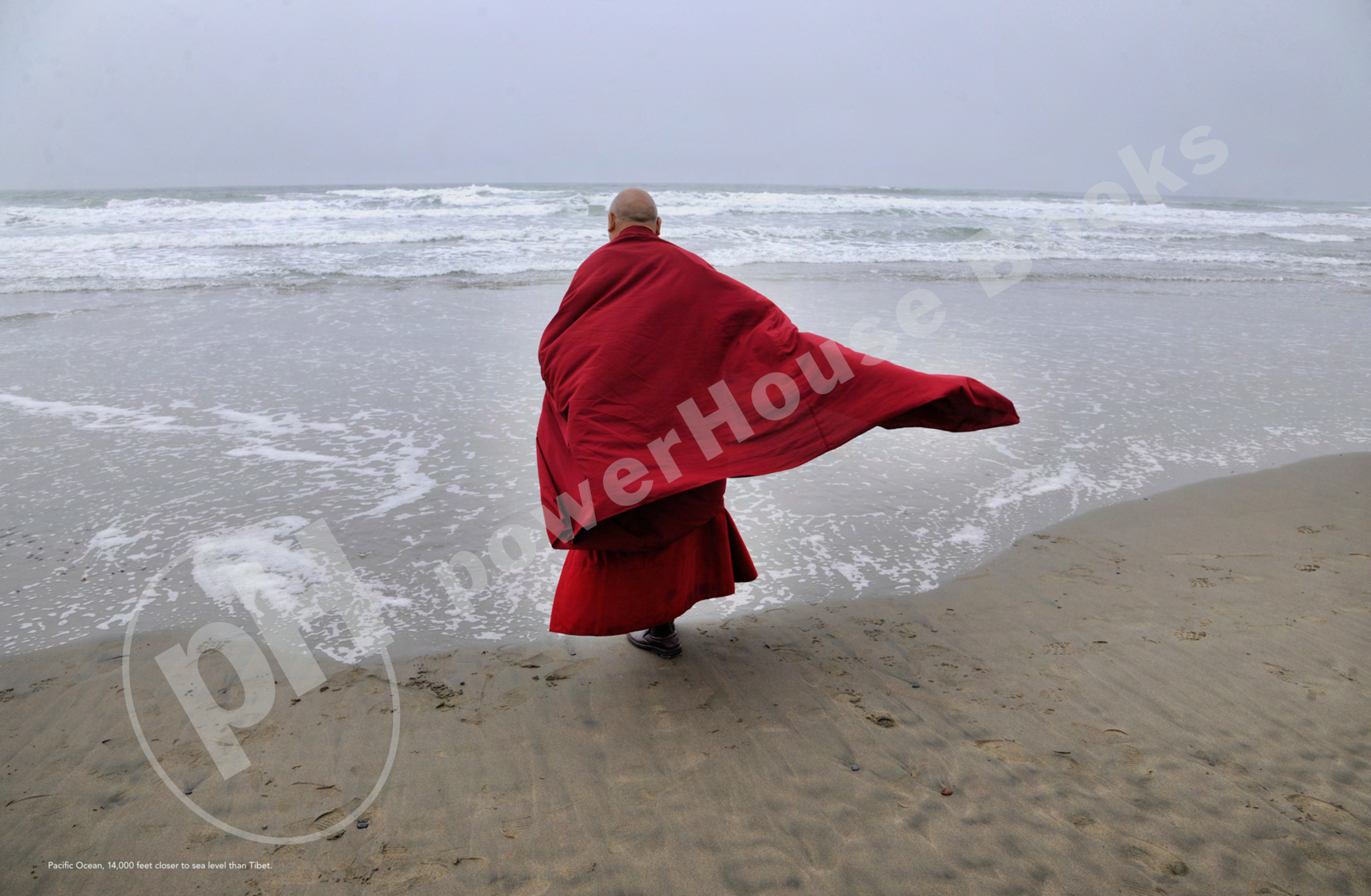
Pacific Ocean, 14,000 feet closer to sea level than Tibet.