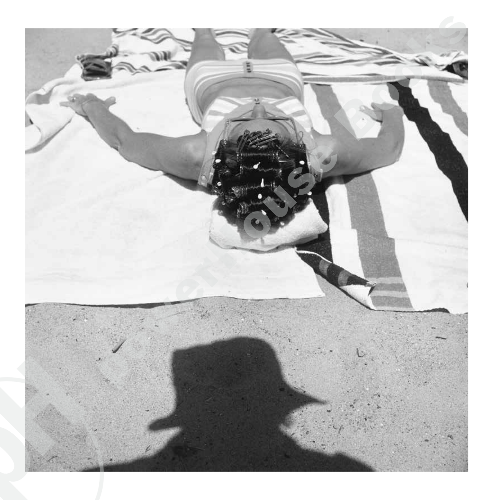
July 27, 1971 – Chicago