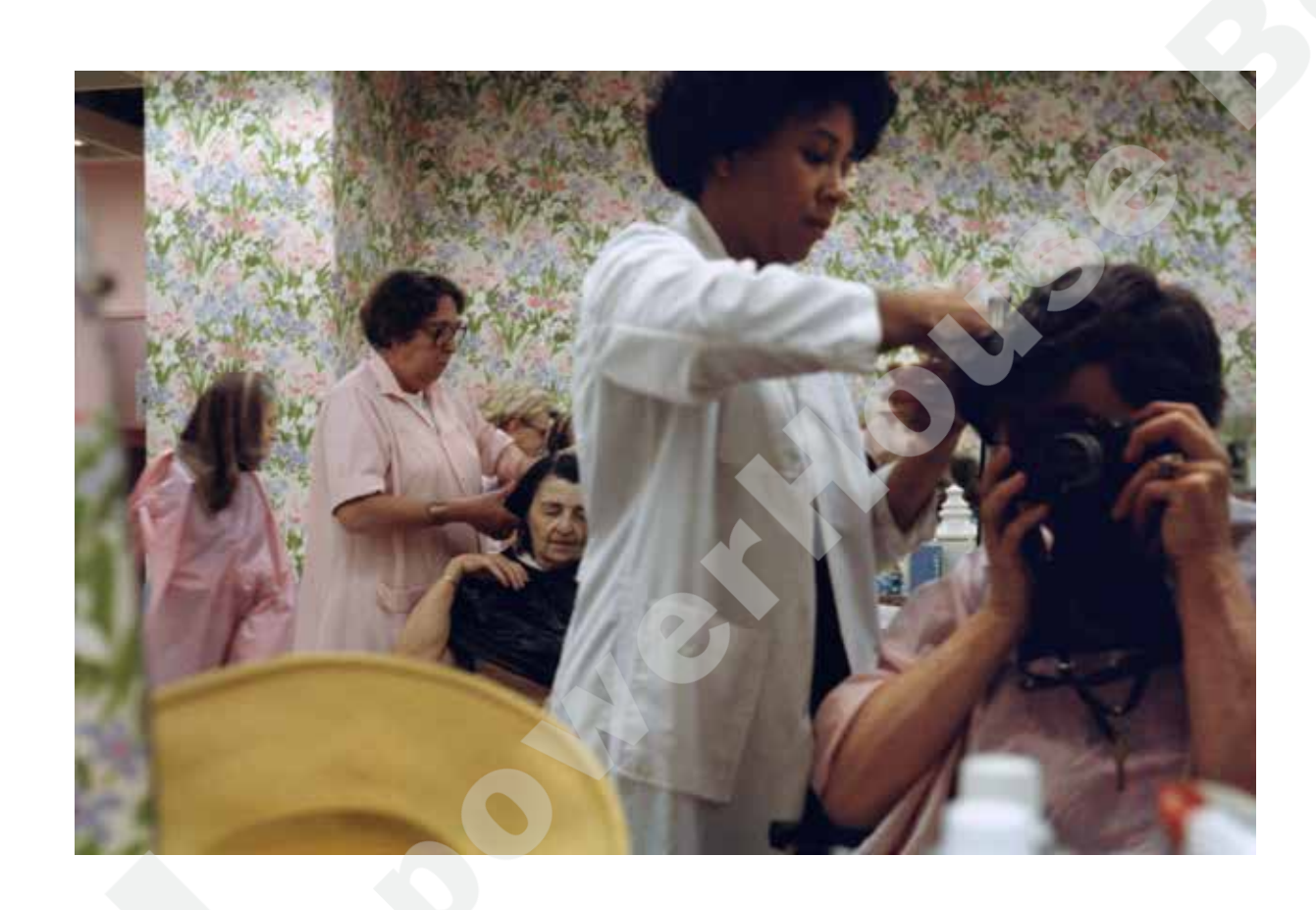
June 1978 – Chicago area