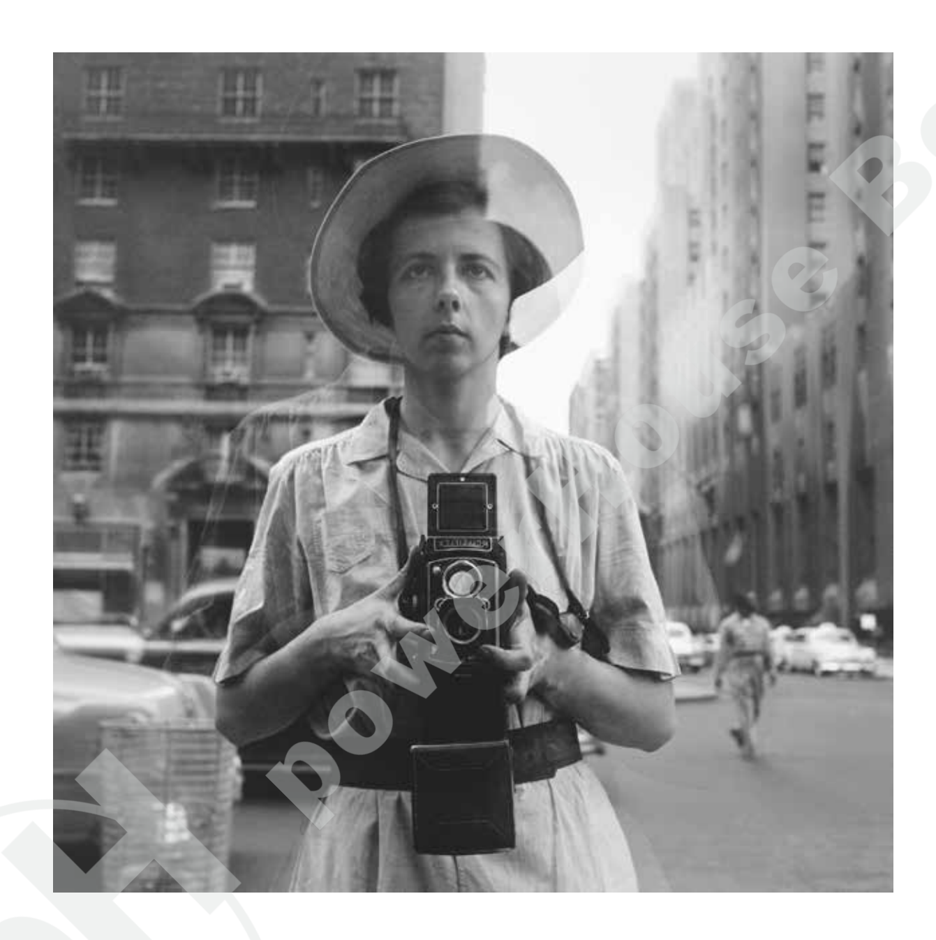
July 24, 1954