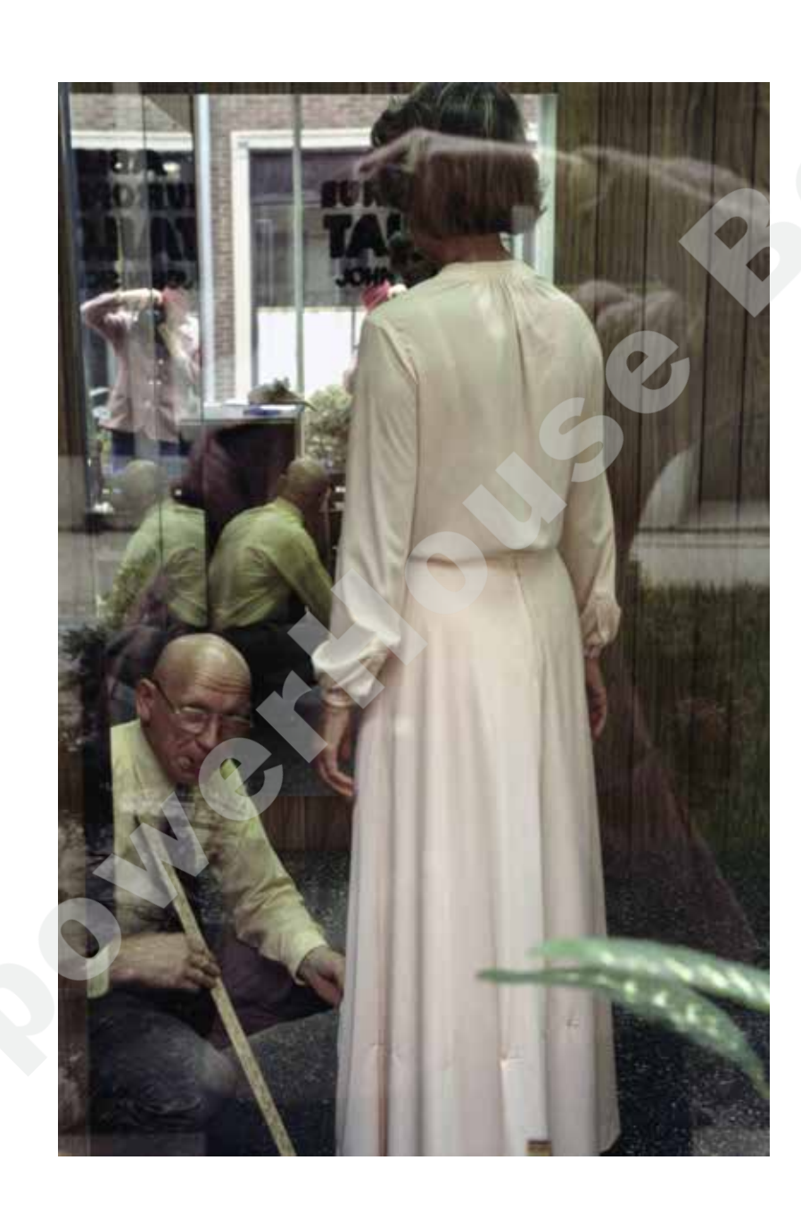
June 1978 – Chicago area