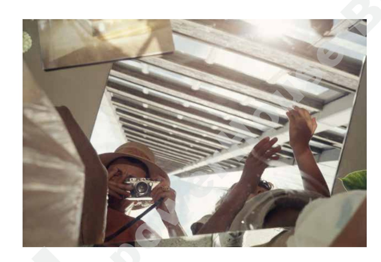
July 1975 – Chicago area