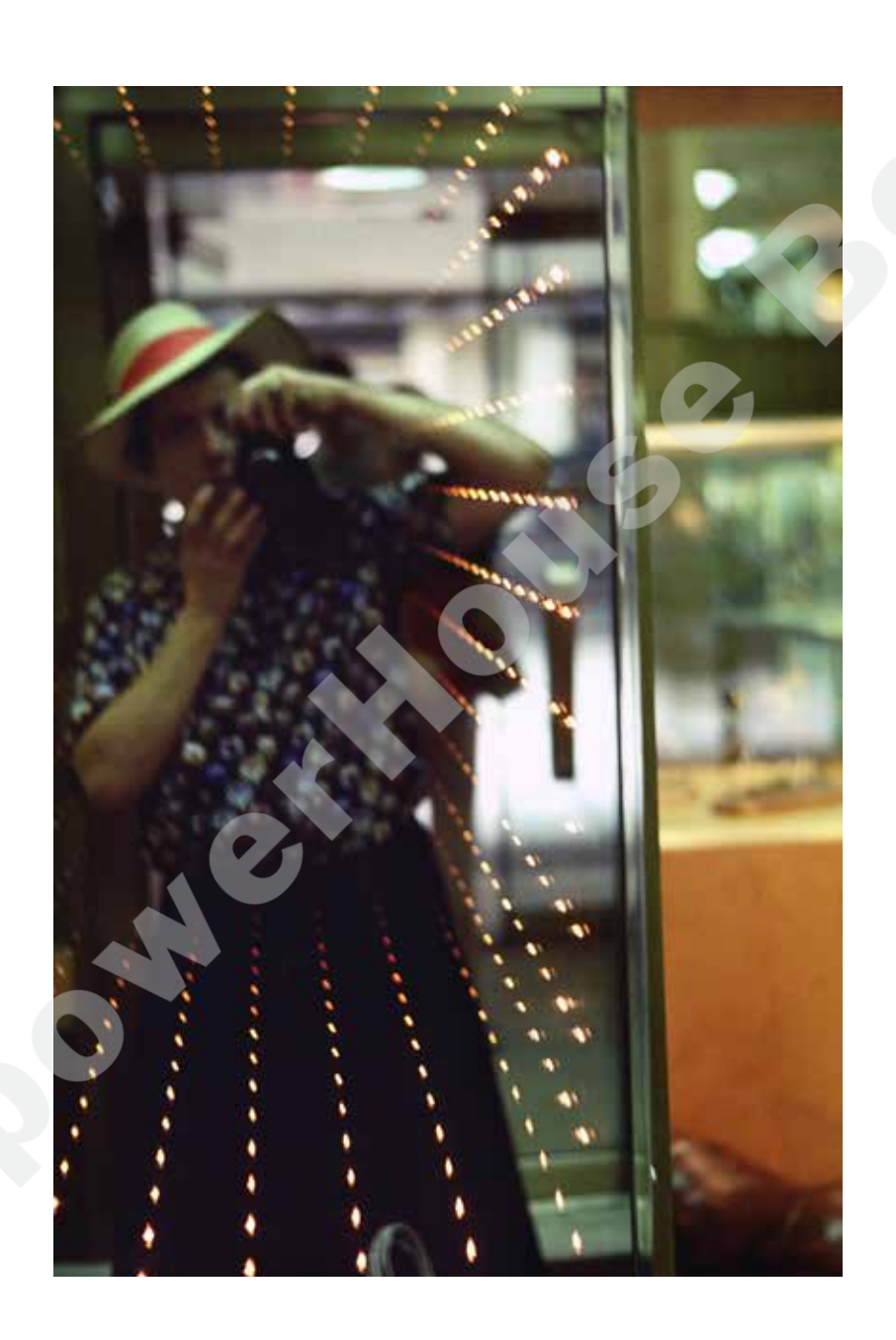
August 1976 – Chicago