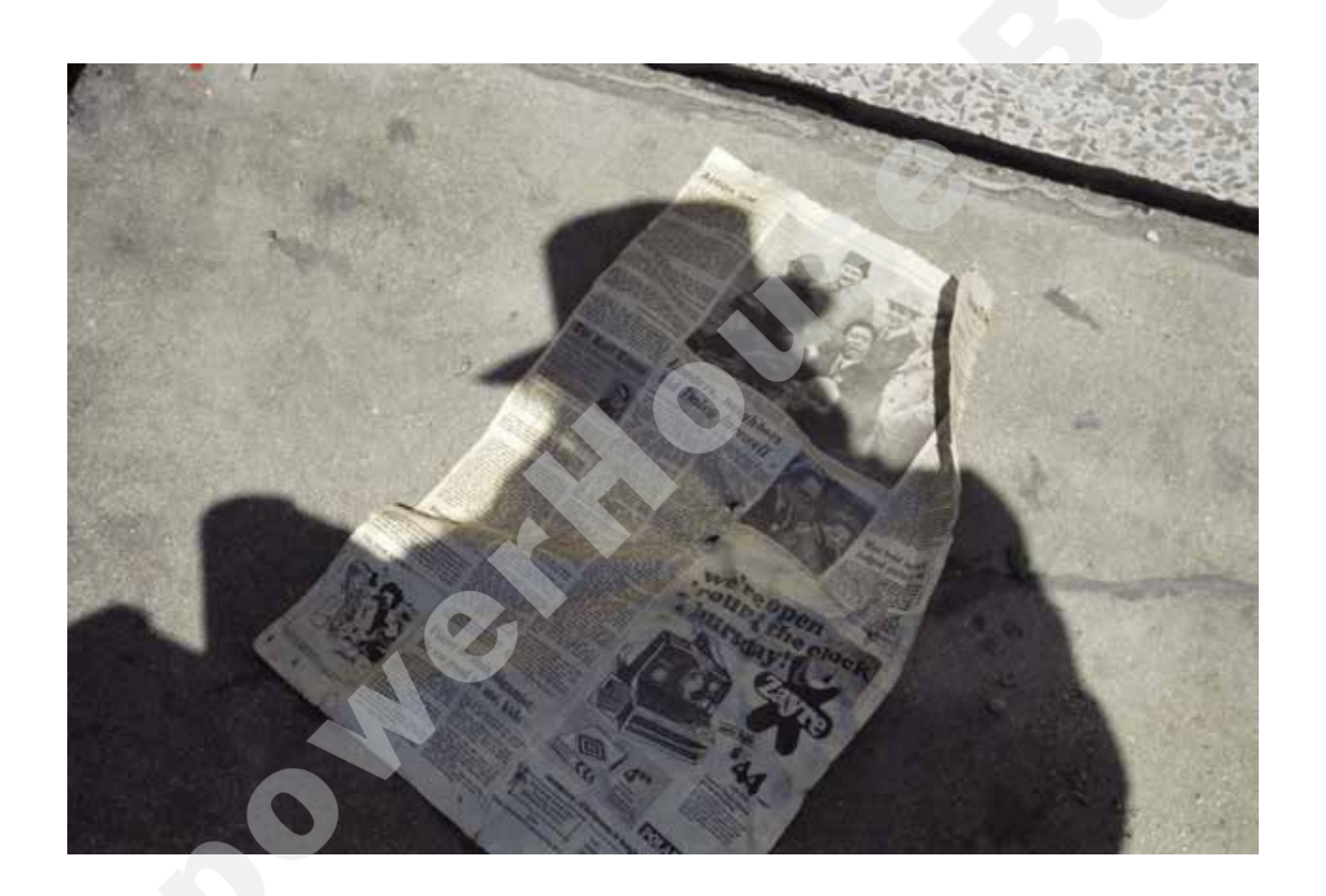
May 1977 – Chicago area